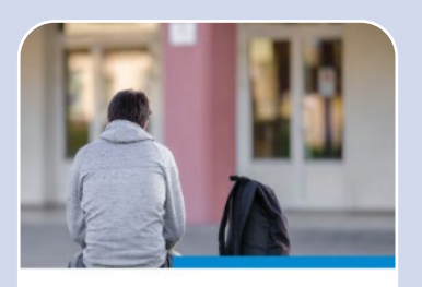
Substance Use Disorder (SUD) Harm Reduction