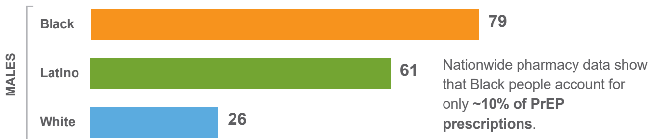
2019 rate of new HIV diagnoses per 100,000

BLACK AND LATINO MALES IN SAN FRANCISCO ARE AT DISPROPORTIONATE RISK FOR HIV 2